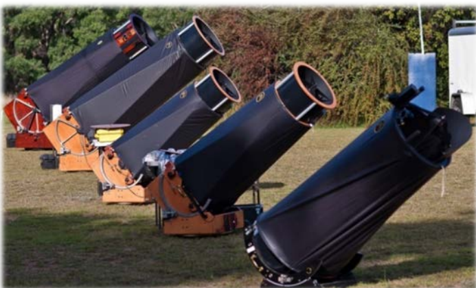
A small selection of the OzSky Star Safari telescopes

However, as it is looking like OzSky 2026 may have yet another "Full House" of observers, there is a very good chance that most of the telescopes in the arsenal should be available for your observing pleasure.