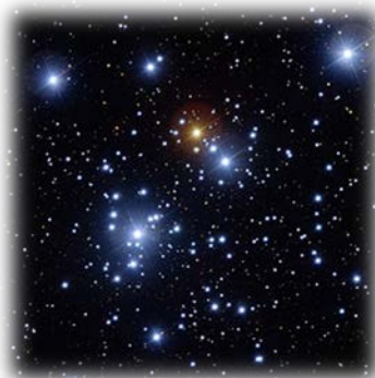
The Jewel Box (NGC 4755) in Crux