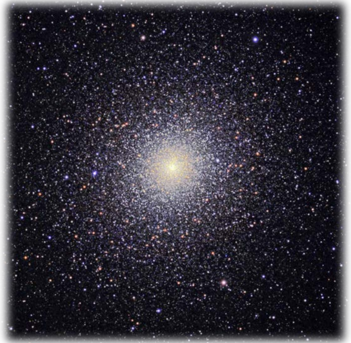
47 Tucanae (NGC 104) in Tucana

As mentioned previously, this list is just a very small sample of some of the Southern Skies Eye Candy objects and will hopefully inspire you to get some ideas together for your own OzSky Star Safari southern skies observing lists.