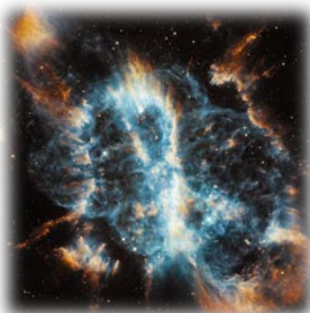
Spiral Planetary (NGC 5189) in Musca