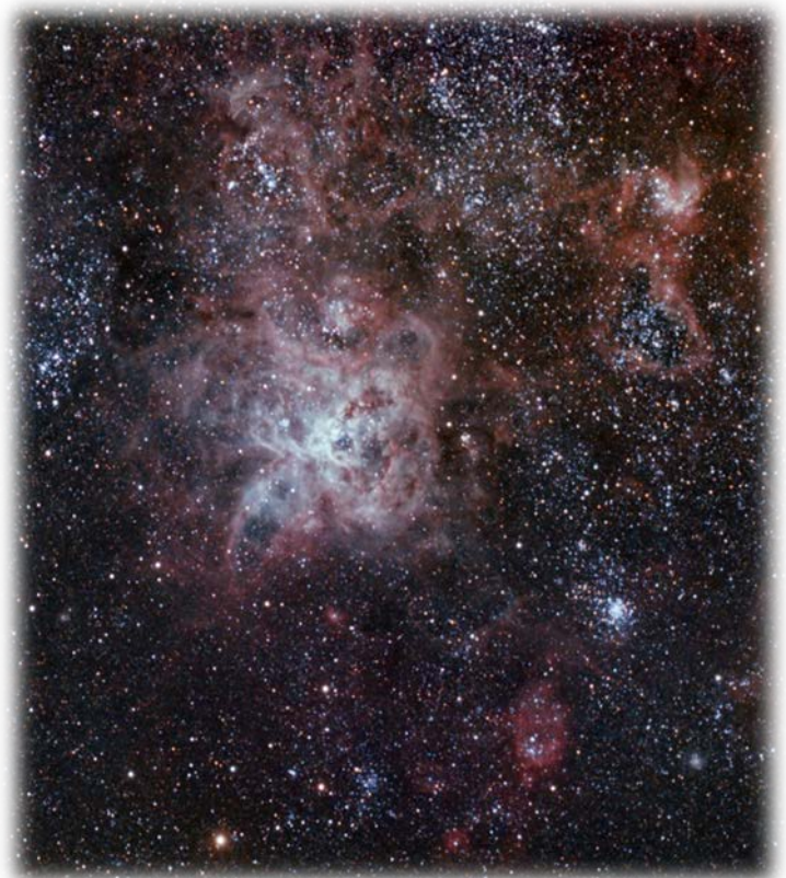
The Tarantula Nebula (NGC 2070) in Dorado