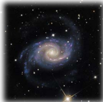
Seyfert Galaxy (NGC 1566) in Dorado