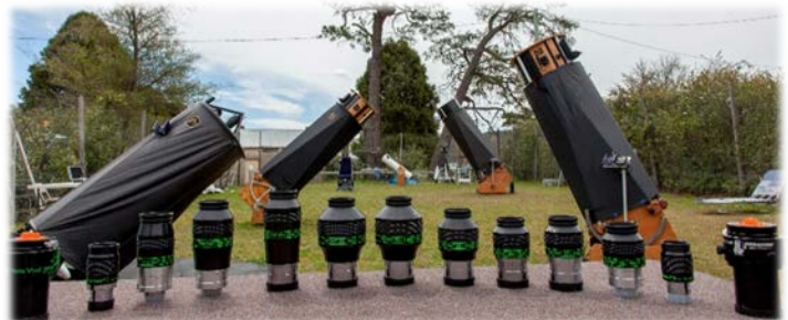
A small selection of the OzSky Star Safari eyepieces

Please feel free to bring any of your own favourite eyepieces or filters if that's what you prefer to observe with. In the past, some attendees have even brought their own BinoViewers with full paired sets of eyepieces, for example.