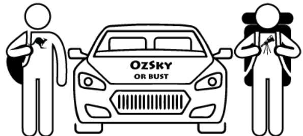
Consider sharing a Rental Car with another OzSky colleague. It's a great way to share the costs and make new friends!

Oh, and just remember... we drive on the LEFT side of the road here in Oz!