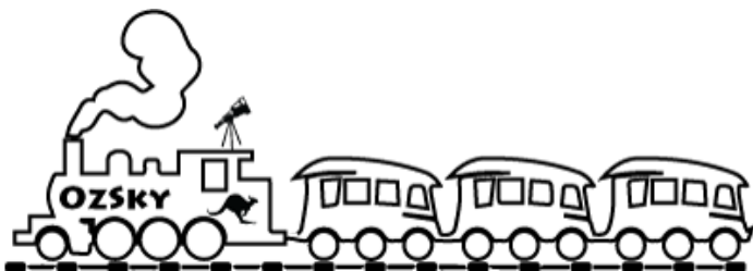
Catching the train is one of the many ways to travel between Sydney and The OzSky Star Safari

Cancellation of train bookings for overseas travellers sometimes needs to be done by telephone. NSW TrainLink Office hours are usually 7:00am-10:00pm daily (Australian Eastern Standard Time).