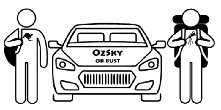
Consider sharing a Rental Car with another OzSky colleague It's a great way to share the costs and make new friends!

The mailing list address is: <u>OzSky2025@OzSky.org</u>.