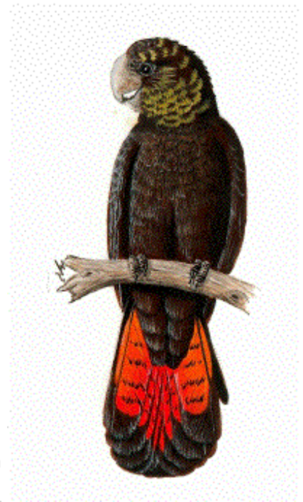
Glossy Black Cockatoo (an endangered species) are common in the Pilliga Forest.